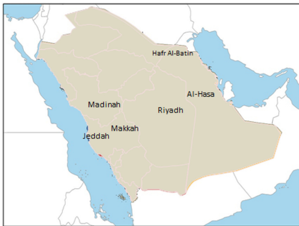
Figure 1 A map of the Kingdom of Saudi Arabia showing the main cities described in this paper: Riyadh (the capital); Al-Hasa (2013 outbreak); Jeddah (2014 outbreak); Hafr Al-Batin (community cluster); and the holy Cities (Makkah and Madinah).