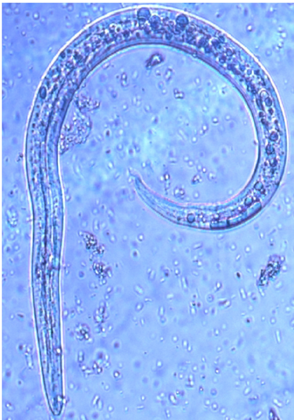
Figure 2 Baermann test: Angiostrongylus vasorum , first stage larva.

gold standard to diagnose angiostrongylosis. Nonetheless, this test is relatively time-consuming (8–36 hours), requires operator skills, and has inherent shortcomings, such as the inability to detect the parasite during the prepatent period and when larvae are not being shed, even in the presence of severe clinical signs. The prepatent period of A. vasorum is long and variable, ranging from 1 to 4 months, although the patency usually begins between ~40–60 days after infection. 6,13,100,103