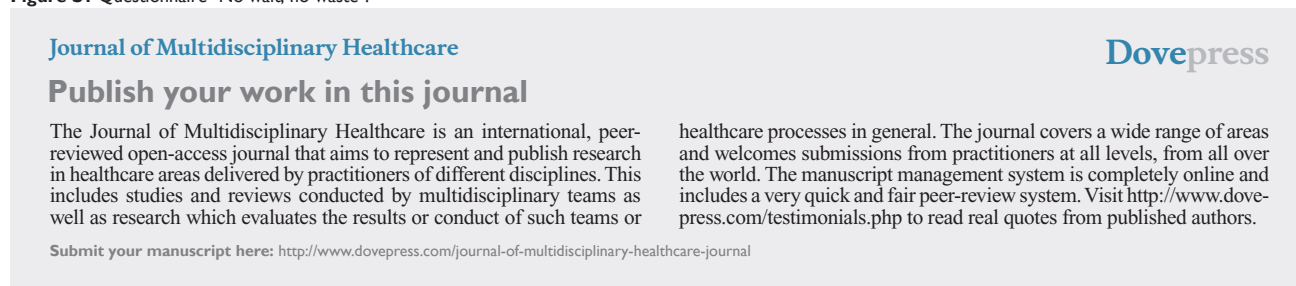
Figure S1 Questionnaire "No wait, no waste".