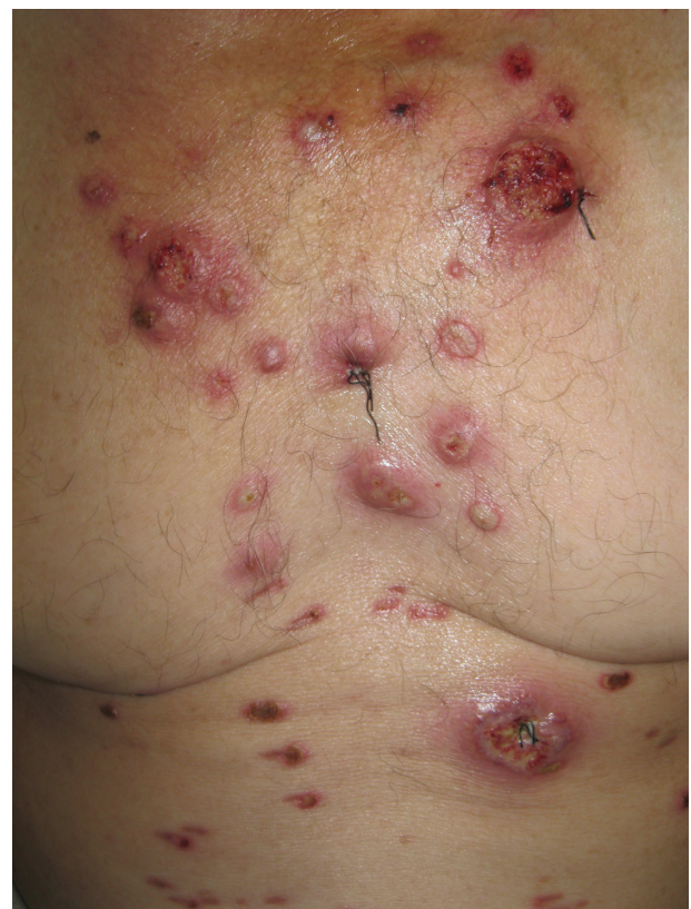
Figure 4 Bullous variant of pyoderma gangrenosum, in a patient with acute myeloid leukemia, presenting overlap features with bullous variant of Sweet's syndrome.