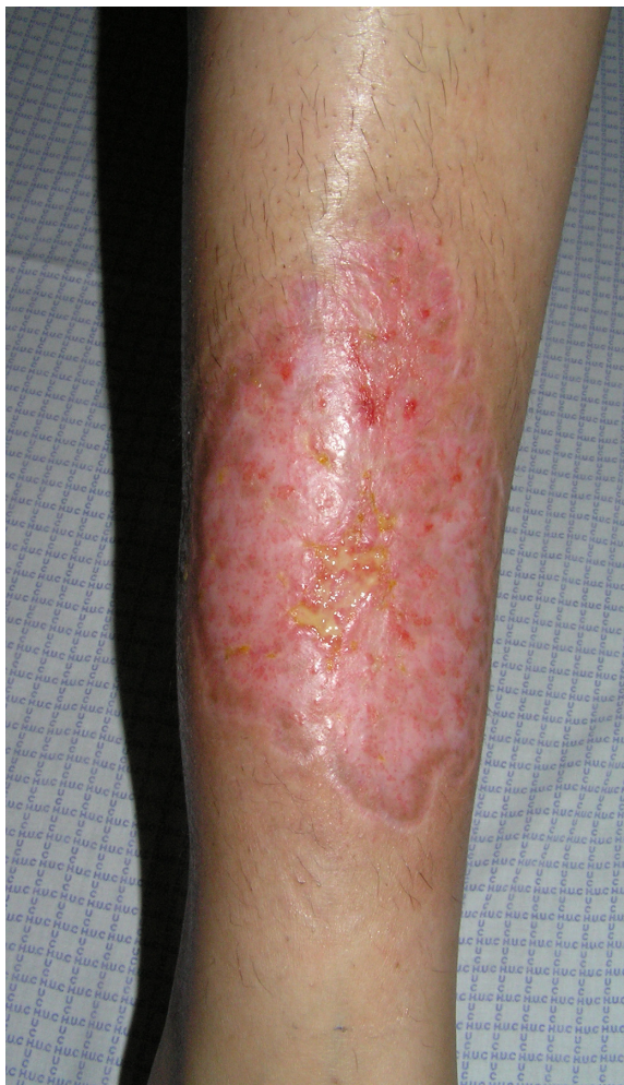
Figure 3 Characteristic cribriform scar after healing of pyoderma gangrenosum.

Pathological skin changes depend on the type of lesion (ulcerative, pustular, bullous, and superficial granulomatous), stage of evolution, and the site from where the specimen is obtained. The active untreated expanding lesions typically show dense neutrophilic dermal infiltrates, often forming micro-abscesses and occasionally extending to the subcutis. Vasculitis is not the main observation, but it may occur along with leukocytoclasia. The fully developed ulcers may only present marked tissue necrosis and surrounding mononuclear