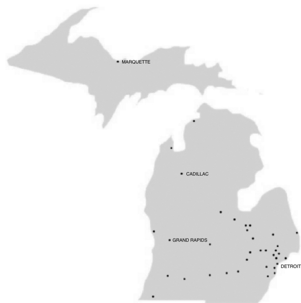
Figure 2 MARCQI sites across Michigan.

Completeness of level I and II data is 98.5%. A case is defined as a scheduled qualifying procedure that matches