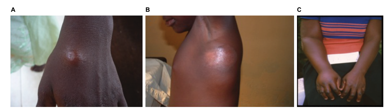
Figure I Non-ulcerative forms of BU of (A) the left hand showing a nodule, (B) the trunk showing a plaque, (C) the right upper limb showing the edematous form. Abbreviation: BU, Buruli ulcer.

M. ulcerans disease (BU) manifests as a painless skin nodule, papule, or plaque, which may be associated with a rapidly expanding area of edema. All these early lesions progress to central ulceration with undermined edges over a variable period of weeks (Figures 1 and 2).<sup>23</sup> Lesions may occur at any location, but a predilection for affecting limbs has been observed. Interestingly, in spite of the presence of large ulcers, patients usually have no systemic symptoms, which together with the painless nature of ulcers may explain why sufferers seek medical help late. At advanced stages of the