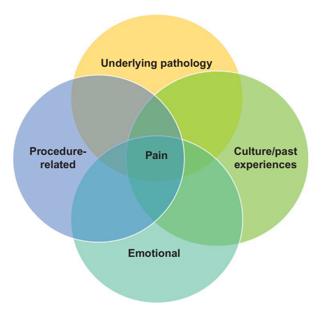
Figure I Pain in chronic wounds: a multifaceted problem.

Nociceptors respond to several forms of stimulation, including thermal, chemical, and mechanical. Injured and inflamed tissues release a wide range of chemical mediators, including prostaglandins, leukotrienes, histamine, bradykinin, acetylcholine, and serotonin. These chemical mediators stimulate nociceptors or sensitize them to the effect of nociceptive stimuli. Nociceptive stimulation that activates C fibers can cause neurogenic inflammation that produces vasodilation and increased release of chemical mediators.<sup>3</sup> This in turn increases inflammation, which further heightens sensitivity to pain. Substance P, also released in response to nociceptive stimulation, can contribute to development and maintenance of chronic pain.<sup>4,5</sup>