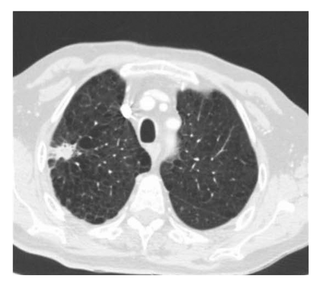
Figure 3 Spiculated nodule in a high-risk patient. ENB results were consistent with aspergilloma. Long-term follow-up has confirmed the benign diagnosis which spared this patient (with limited lung function) a risky surgical resection. Abbreviation: ENB, electromagnetic navigation bronchoscopy.

The performance of ENB is clearly inferior to the gold standard of surgical resection. ENB's pooled sensitivity for malignancy has been reported as 71% and accuracy for malignancy does not exceed 80%.33 Direct comparison of ENB with conventional or alternative navigational techniques is limited to a single trial assessing the yield of ENB compared to radial ultrasound probes.30 In that randomized trial, diagnostic yields of 59%, 69%, and 87.5% were reported for ENB, radial ultrasound probe, and the combination of both techniques, respectively. The combined procedure was statistically superior to either ENB or radial probe ultrasound as stand-alone interventions. Trials comparing conventional bronchoscopy with ultrasound probe-guided sampling of peripheral pulmonary nodules have shown the latter to be more sensitive, even for small lesions.34,35 Probe location and lesion size determine diagnostic yields with this technique, which faces many of the