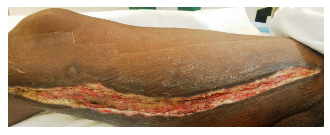
Figure I Wound before application of VAC dressing. Abbreviation: VAC, vacuum-assisted closure.

The skin equivalent (Apligraf<sup>®</sup>; Novartis Pharmaceuticals Corporation, East Hanover, NJ, USA) comprises a dermal equivalent, and is reconstituted with collagen and dermal fibroblasts that are biosynthetically active and have a differentiated epidermis that arises from cultured keratinocytes put onto the surface of the dermal equivalent. This is another nonsurgical option for treatment of chronic wounds that gives good results.<sup>64</sup> This can be done as an outpatient procedure. Living skin equivalent increases the healing rate and promotes healing. Patients with SV harvest wounds with compromised circulation can have good healing without revascularization