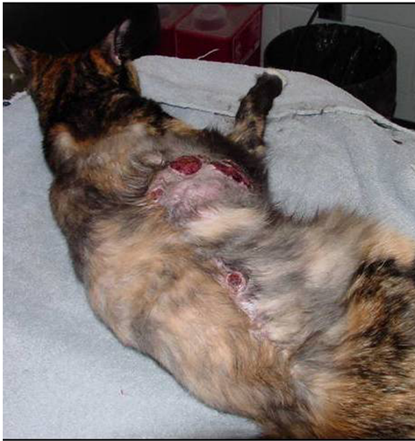
Figure 5 Multifocal tumor regrowth with ulceration following surgery. Notes: Note that there are masses along the entire length of the scar.

en bloc to a commercial veterinary pathology laboratory for histopathological examination.