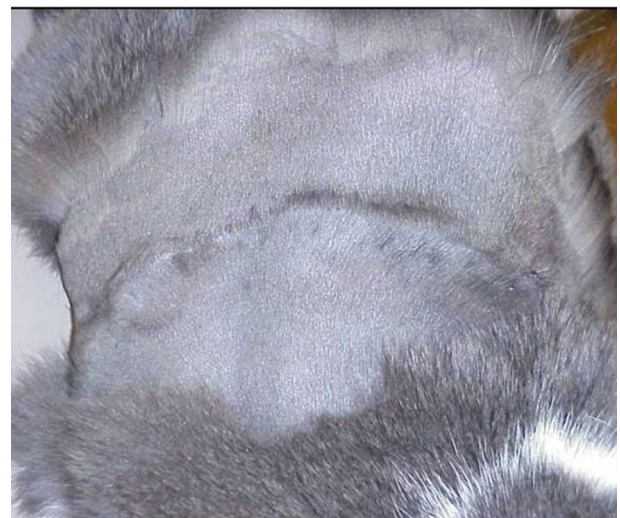
Figure 4 Multifocal tumor regrowth following surgical excision of FISS.

Although wide or radical surgical excision (defined as 3–5 cm of grossly normal tissue in all directions around the tumor and one to two fascial planes deep to it) is the mainstay of treatment for eliminating macroscopic FISS, cures remain uncommon. 24,25,36,37 Most tumors will recur locally, especially when treated with surgery alone, with reported median times to recurrence ranging from 2 months to >16 months. 25,37 Recurrences often occur at multiple sites along the surgical scar as seen in Figures 4 and 5. Cats with tumors located distally enough on their limbs or tails, where amputation or hemipelvectomy results in wide microscopic surgical margins, are potential candidates for successful treatment with surgery alone. 25,38 However, in reality, these tumors must be located at or distal to the hock or distal third of the antebrachium or tail. Phelps et al 36 reported a 14% local recurrence rate in cats treated with radical excision, defined as 5 cm margins and two fascial planes deep. However, these results must be interpreted with caution as over one-third of the cats (35%) were censored from analysis due to lost to follow-up prior to documentation of local recurrence. 36 When surgical excision is performed, the specimen margins should be inked or identified with suture. The entire specimen should be adequately fixed in formalin and submitted