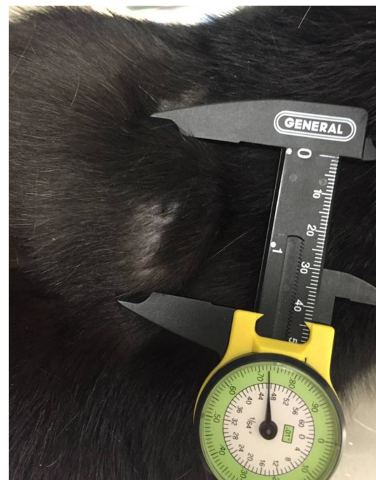
Figure 1 Tumor measurement with calipers.

When a cat is presented for a subcutaneous mass, it is important to consider the history. Points to note include the cat's vaccination history, the location of the mass, when it was first noticed, any change in size, and the current size of the mass (measured with calipers; Figure 1). If FISS is even remotely possible, indications for biopsy are based on the 3-2-1 rule. 13,32,33 Any mass that has persisted for >3 months, is >2 cm, and/or is growing over the course of 1 month since an injection was given at that site, an incisional biopsy is strongly recommended. Fine needle aspiration with cytology is the least invasive and least expensive form of incisional biopsy. Although it does not always yield a definitive diagnosis of FISS, cytology can be helpful in ruling in or out other differential diagnoses, such as abscesses. Alternative forms of incisional biopsy including needle core, punch, and wedge biopsies may be considered. Because FISS are heterogeneous masses, multiple samples from different areas should be collected to ensure definitive diagnosis, especially when using less invasive biopsy techniques (eg, needle core or punch biopsy). When performing an incisional biopsy, it is