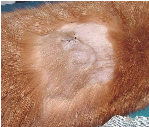
Figure 2 Incisional biopsy of FISS.

Once FISS has been confirmed, thoracic radiographs are recommended to look for evidence of pulmonary metastatic disease. Additionally, advanced imaging (most commonly computed tomography scan as in Figure 3, but occasionally magnetic resonance imaging) is encouraged for radiation and/or surgical planning. 23,34 Complete blood count, serum biochemical profile, urinalysis, T4, and FeLV/feline immunodeficiency virus (FIV) testing are often performed as part