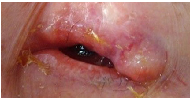
Figure 1 An extensive left upper eyelid mass.

An 80-year-old female complained of a 1-year history of ocular irritation, blurred vision, and gritty sensation despite topical tetracycline 1% three times daily and erythromycin 0.5% twice a day for refractory blepharoconjunctivitis and recurrent chalazion in the left eye. On examination, her best-corrected visual acuity was 20/20 in the right eye and hand motion in the left eye. External examination revealed mild telangiectasia on the left upper eyelid with a mass consisting of multiple, firm, thickened, irregular nodules (Figure 1). This mass was fixed to the underlying tissue and resulted in complete ptosis without any eyelid blinking. Consequently, the left eye exhibited a scanty tear meniscus, central corneal haze and neovascularization, and diffuse conjunctival injection.