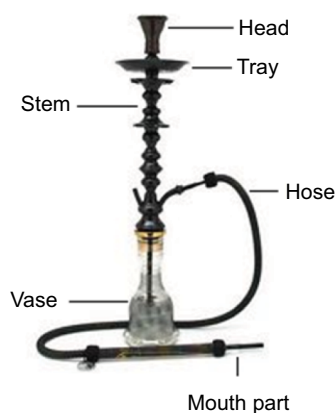
Figure 1 A waterpipe machine. The major components of a waterpipe machine are labeled and include the head, stem, vase, and hose.

produced by a single episode of waterpipe is about five times that produced by a single cigarette. 4 Similarly, exposure to carbon monoxide is at least several folds higher during waterpipe smoking compared with that of cigarette smoking. 5 Furthermore, the polycyclic aromatic hydrocarbons in waterpipe smoke are many times more than that of cigarette smoke. 6 In addition, the style of waterpipe smoking results in a dramatically higher exposure volume to smoke, more tobacco consumption per smoking event, and longer smoke inhalation periods. 7 Finally, tobacco in waterpipes is usually mixed with sugar, glycerol, and flavors, this mixture is burned by charcoal. 1 Thus, it is expected that waterpipe smoking will have a distinct effect on oral microbial flora.