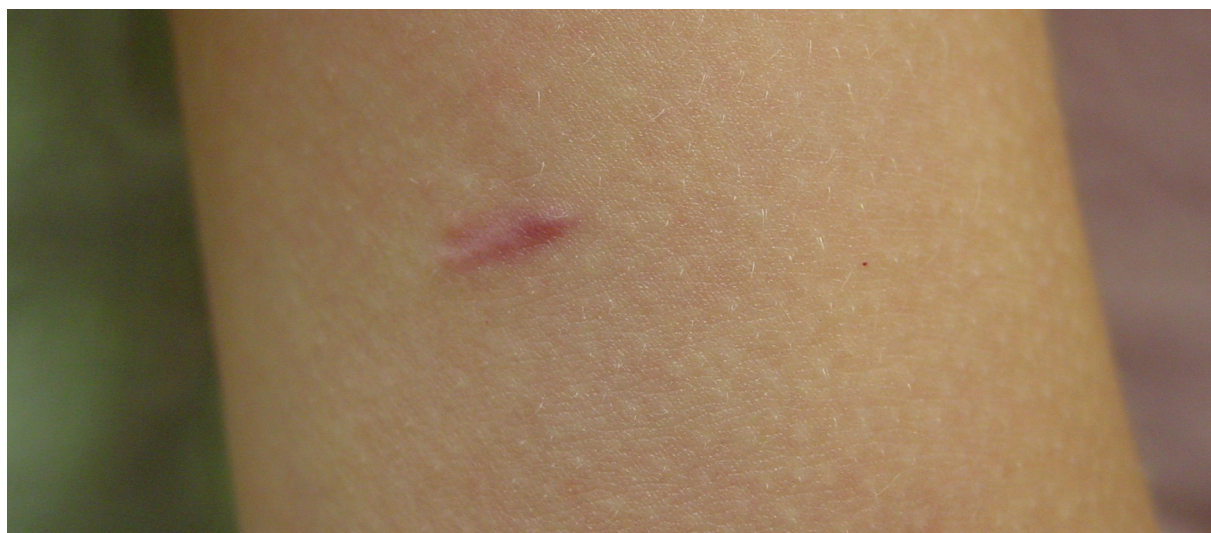
Figure 2 Appearance of typical scar seen 6 months after implantation of histrelin implant.

the implants are placed by a pediatric surgeon in a outpatient clinic setting with use of local anesthesia and distraction techniques. Conscious sedation and general anesthesia have been utilized at other medical centers. 9 Certainly, the cost of implantation would be expected to be higher using these means of anesthesia.