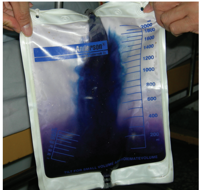
Figure 3 The longer the PVC bag stayed in use for a patient, the deeper the color purple the bag became, despite changing sterile PVC urine bags from 2 different companies.

femoral neck about 3 years ago. He suffered from PUBS off and on for 10 months. He regularly took doxazosin mesylate (Doxaben®) 1 mg per day for hypertension and BPH, and quetiapine fumarate (Seroquel®) 100 mg per day for vascular dementia with delirium.