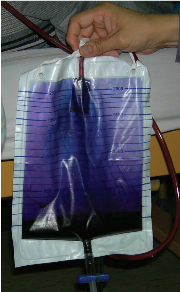
Figure 2 The urinary catheter drainage system with changing color from red to purple and sometimes with differently colored tube and bag in case 3 with purple urine bag syndrome.

Case 5, an 80-year-old male, had been a patient with vascular dementia (VaD) with delirium since 2 years ago. He had also suffered from hypertension and BPH for 20 years. He became long-term bedridden because of fracture of the left