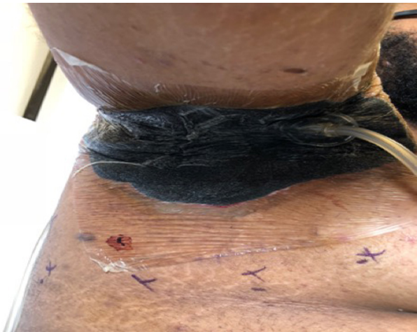
Figure 3 Extent of diminished sensation to pinprick on postoperative day 1; right axilla and right anterolateral chest wall.

He requested the regional team perform the same block, as he was satisfied with the analgesia. ESB was performed in a similar fashion as described above with similar analgesic efficacy. Average time to first narcotic consumption after each T2 ESB was 39.3 hours.