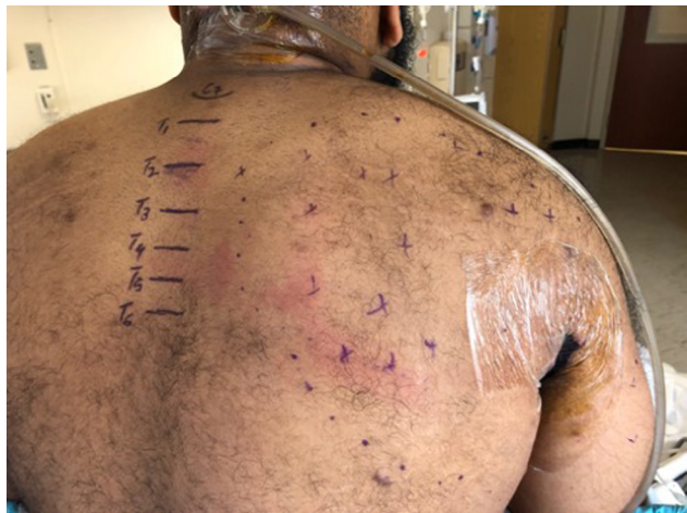
Figure 2 Extent of diminished sensation to pin prick on postoperative day 1; right shoulder and right scapula.