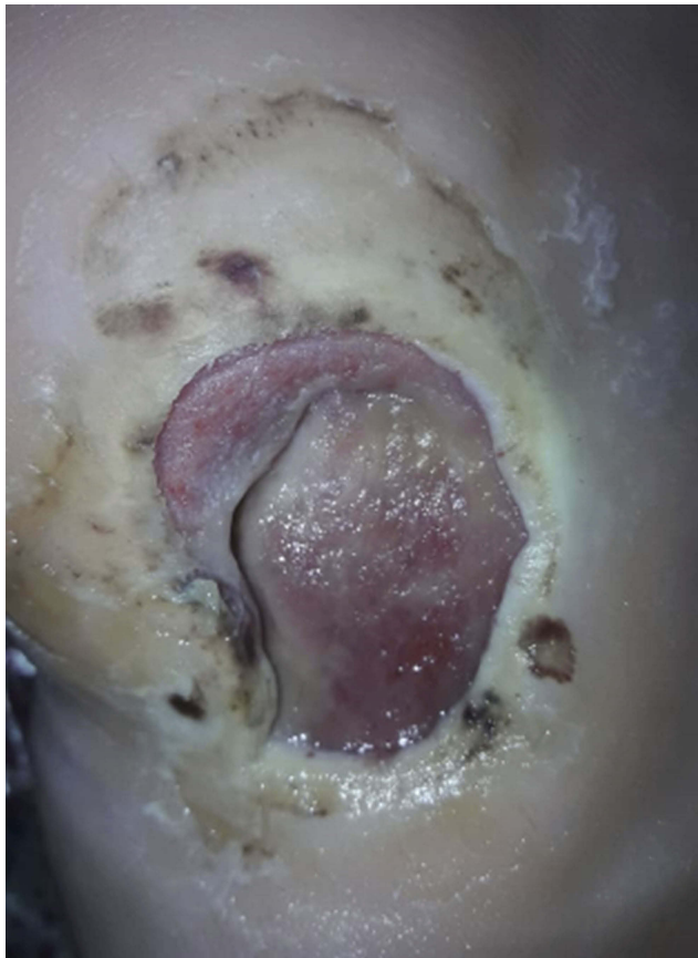
Figure 1 Before intervention with honey.