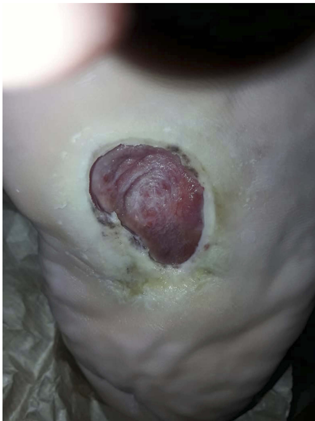
Figure 5 Before intervention in the control group.