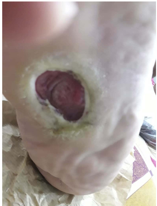
Figure 6 After intervention in the control group.