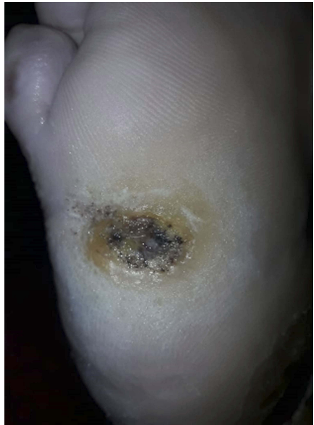
Figure 2 After intervention with honey.