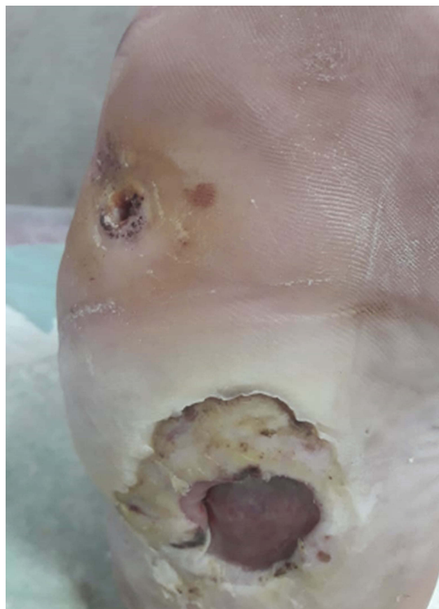
Figure 4 After intervention with olive oil.

of wound healing in these patients. 15 In another report of a case series, Mohamed et al examined the effect of honey dressing on the healing of diabetic foot, pain, and cost of dressing, and found that honey has a significant impact on improving diabetic foot; consequently, pain and costs of healthcare were decreased considerably. 16 The healing properties of honey can be explained by its antimicrobial and anti-inflammatory effects, moisturizing in the wound bed, osmotic effects, decreasing edema in the cells of the wound, accelerating the process of angiogenesis and granulation in the wound, accelerating collagenases and epithelialization in the wound, increasing activities of lymphocytes and phagocytes, and accelerating debridement of necrotic tissue. 11,16–18