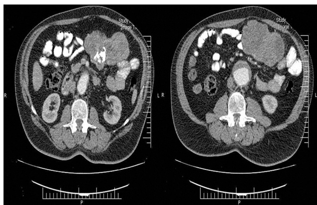
Figure 1 (A, B) Computed tomography scan depicted perijejunal mass sized 141*85 mm with central necrosis and calcification.

Despite the normal result of the respiratory examination, metastatic workup for lung was performed by requesting a chest spiral computed tomography scan without injection. However, the report depicted no metastatic lesions in the lungs.