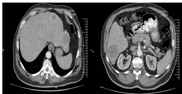
Figure 2 (A, B) Scattered metastatic hypodense lesions in liver.

Due to indecisive results obtained from previous investigations, it was necessary to conduct an ultrasound-guided needle biopsy of liver lesions. The biopsy report surprisingly demonstrated a fatty liver. Moreover, it was reported that definite discrimination between reactive and neoplastic infiltrative cells was impossible. Furthermore, there is a possibility of admitting a sample from an inappropriate region and therefore it was not a true representative of the lesions tissue. With that being said, further investigation was suggested in the report.