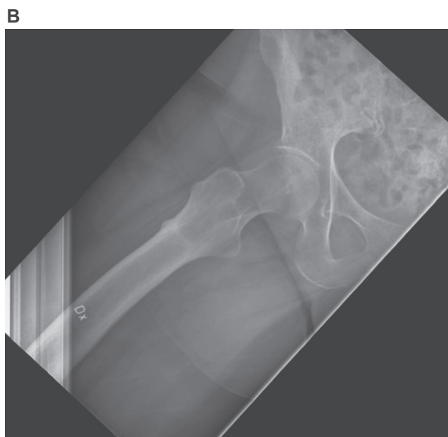
Figures 2 A and B Anteroposterior and lateral radiographic views of the hip joint showing an undisplaced subtrochanteric fracture (appeared mainly as subtrochanteric sclerosis on the lateral view). Note the lateral cortical thickening at the site of the fracture.

between long-term BP therapy and femoral fragility fractures. In patients with early changes, such as prodromal hip/thigh pain and lateral cortical thickness, stopping BP therapy and prophylactic nailing should be considered. In patients with femoral fragility fractures, healing disturbances are