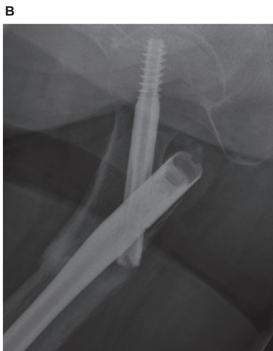
Figures 3 A and B Radiographs taken nine months postoperatively. The fracture is now healed with callus filling the fracture gap.

not uncommon, and should be anticipated and treated accordingly. If continuation of antiresorptive therapy is indicated despite the occurrence of femoral fragility fractures, teriparatide represents a promising alternative to BPs because it reduces microdamage accumulation caused by SSBT.