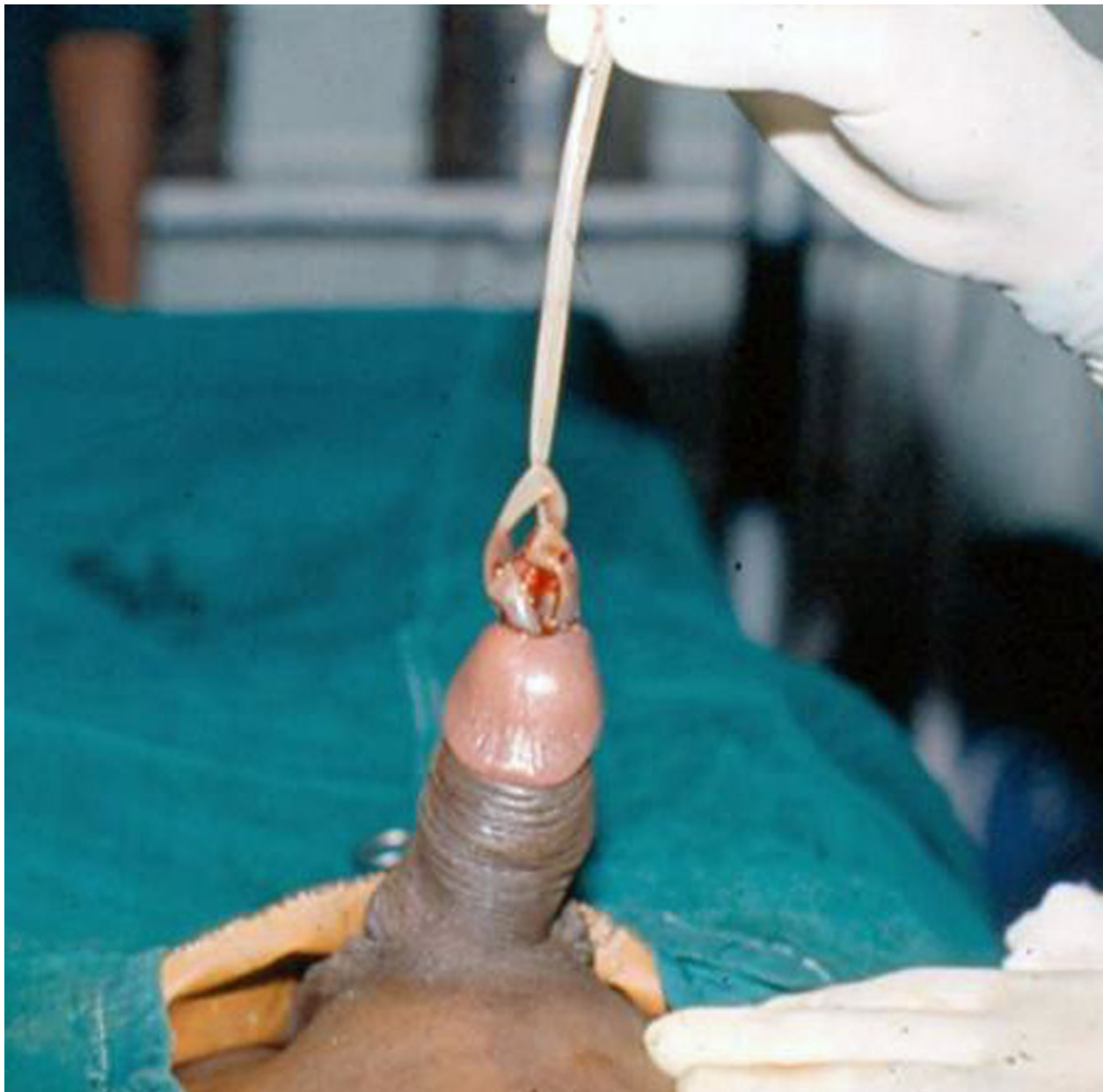
Figure 3 Case 3: Knotted Ryle's tube protruding from penis, with bleeding.

cystostomy is sometimes required for large, impacted foreign body removal. After removal, psychiatric referral is recommended to prevent a repeat of the episode, if the object was self-introduced. 5