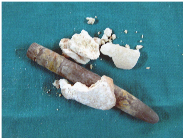
Figure 1 Case 1: Broken oxalate calculus which was encapsulating pen casing.

broken catheter was first fixed with sticking and then used to drain the patient's bladder.