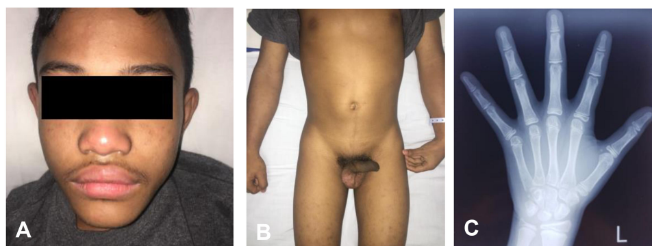
Figure 1 Acne and facial hair (A) and enlarged penis with scant pubic hair (B) in a 6-year-old boy, showing signs of precocious pseudo-puberty as shown on both cases. Advanced bone age of Case 2 (C).

A 6-year-old boy with an enlarged left testicle starting 3 months before the presentation. Enlarged left testicle was painless without signs of inflammation, while the right testicle was normal. The pubertal state was A1P3G3 (see Table 1).