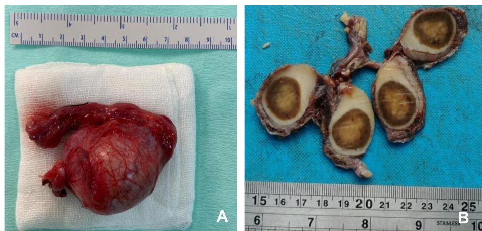
Figure 3 Macroscopic anatomy findings of the left testis from the patient of Case 1 (A) and Case 2 (B). Note a well circumscribed yellowish-brownish mass inside the testis.