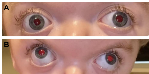
Figure 2 A 2-year-old child with syndromic craniosynostosis demonstrating “exotropia” in the (A) primary gaze and with (B) V-pattern exotropia that is prominent in upgaze.

a retrospective study of 140 craniosynostosis cases that only 9 patients demonstrated changes in ocular position after undergoing reconstructive operations; this led to the proposal that strabismus surgery should be pursued earlier in life, as the benefit of achieving binocularity may outweigh the comparatively small risk of future shifts in ocular position. 19 Further studies are needed to definitively compare outcomes between early and late surgery in the management of craniosynostotic strabismus. Even when strabismus surgery is performed, however, the complex anatomy of these patients makes a curative outcome difficult to achieve. In a retrospective review of 14 craniosynostosis patients that underwent strabismus surgery, Coats et al found that all patients had significant postoperative residual oculomotor dysfunction. 20 Orbital imaging, preferably MRI, can be helpful in preparation for surgery and is particularly useful in cases when there are positional or numerical abnormalities in the extraocular muscles. 21