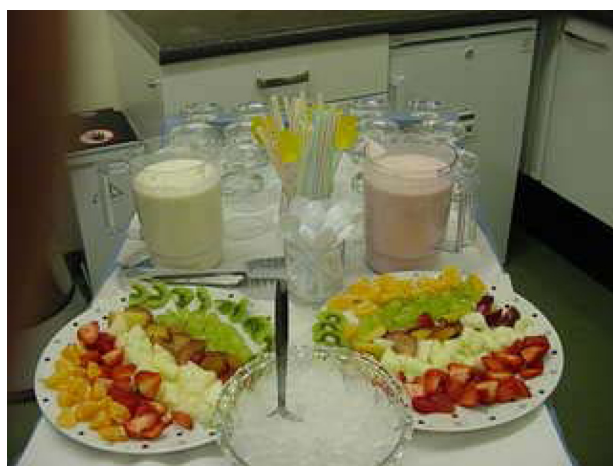
Figure 3 Daily smoothies and fruit round, as provided by the nutritional care assistant.

Although Table 4 shows that total scores were higher at the end of the project, this difference was not significant ( P = 0.154 using Mann–Whitney test). An analysis of individual items on the staff quiz was also conducted to assess knowledge and skills in relation to specific items. Overall, the staff questionnaire identified that nurses lacked practical knowledge and skills about nutrition. The results did not suggest that the NCA project had much impact on staff knowledge and skills. It must be recognized that the items included on the questionnaire were not validated and that several had a number of possible answers rather than a right