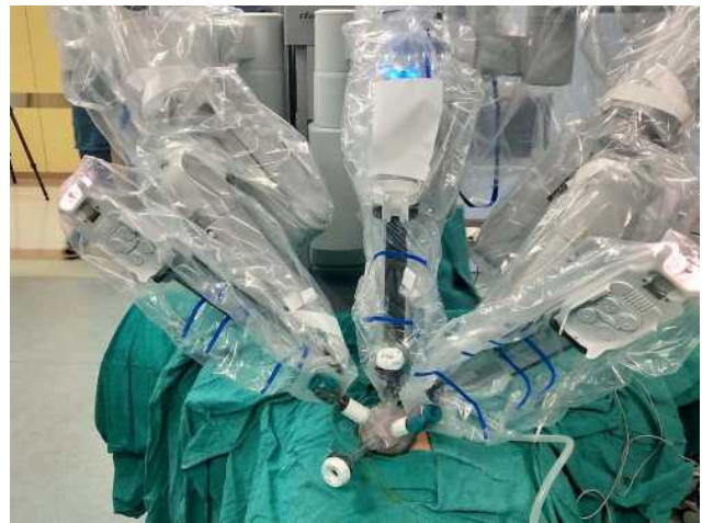
Figure 3 Robotic monopolar scissors and fenestrated bipolar forceps were mounted through the cannulas.

Enterprise Co., Ltd, Taiwan) was placed into the fascia opening, and the LAGIS Single-Site port was inserted through the opening that was covered with the wound protector. A pneumoperitoneum was then created by carbon dioxide infusion up to 14 mmHg. The patient was adjusted to a 15-degree Trendelenburg angle position. The 30-degree 12 mm da Vinci stereo laparoscope connected to the robotic system camera was inserted to confirm atraumatic placement of its primary port. The robotic system was positioned between the patients' legs and docked at the camera port.