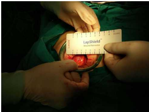
Figure 2 A trans-umbilical skin incision of a transversal length of 3 cm was made.