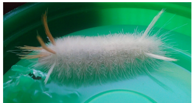
Figure 2 Picture of the larvae of the sycamore tussock moth, Halysidota harrisii Walsh, 1864.

Distributions of blood lymphocytes (CD4 + , CD8 + , CD8 + CD60 + , CD19 + , CD23 + , CD16/56 + , CD25, CD45RA + , CD45RO + ) and monocytes (CD1d + ) were studied in peripheral blood. Absolute numbers of CD4 + T cells, CD25 + cells, CD19 + B cells, and CD1d + monocytes decreased (22, 27, 33, 20%, respectively) one week post reaction, while CD8 + CD60 + T cells and CD23 + cells decreased 48 hrs (33, 74%, respectively) post reaction and CD45RA + naïve T cells decreased (21%) 36 hours post