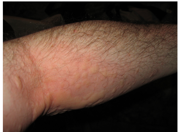
Figure 1 Appearance of contact exposure reaction in an allergic asthmatic patient to the larvae of the sycamore tussock moth, Halysidota harrisii Walsh, 1864. Inflammation and induration are evident in the antecubital fossa (site of caterpillar exposure) with proximal and distal radiation.

The caterpillar was identified as the larvae of the sycamore tussock moth, Halysidota harrisii Walsh, 1864 (Figure 2).