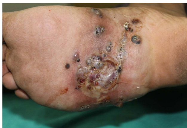
Figure 1 Classic triad of mycetoma with woody hard swelling, discharging sinuses and grains.

As the mycetoma involves mainly the skin and the subcutaneous tissue, the presentation is usually the classical triad of a painless, indurated subcutaneous mass giving a woody hard feel, multiple discharging sinuses, and presence of grains in the purulent or seropurulent discharge 6