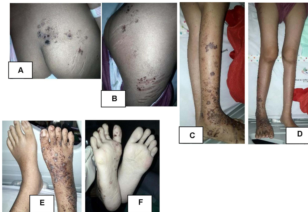
Figure 5 Follow up at 10th day. Showed hyperpigmented patches and several sagging bullae, some burst into erosion covered by brownish crust at gluteus (A), lateral side of femur dextra (B), cruris dextra (C), and dorsum and plantar pedis region (D–F).

HZ lesion may initiate with tingling sensation, itch, or pain, or both for 2–3 days. These symptoms can last until the lesion appeared or may occur episodically. 10 Besides pain, other symptoms that may arise are constitutional symptoms such as malaise, cephalgia, and other flu-like symptoms, which usually will disappear when the skin eruption appeared. Regional lymphadenopathy may also occur. 7