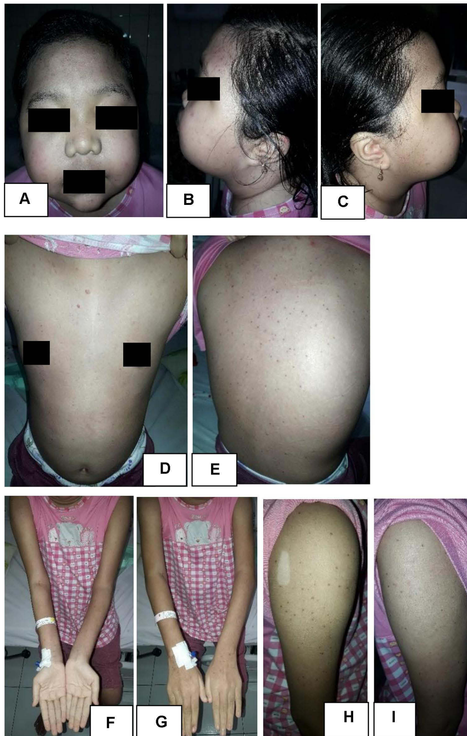
Figure 4 Follow up at 10th day. Showed hyperpigmented macules and patches on facial region (A–C), anterior (D) and posterior trunk (E), and upper extremity (F–I).

reactivation of VZV may occur, causing HZ in approximately one-third of infected people beforehand. 8