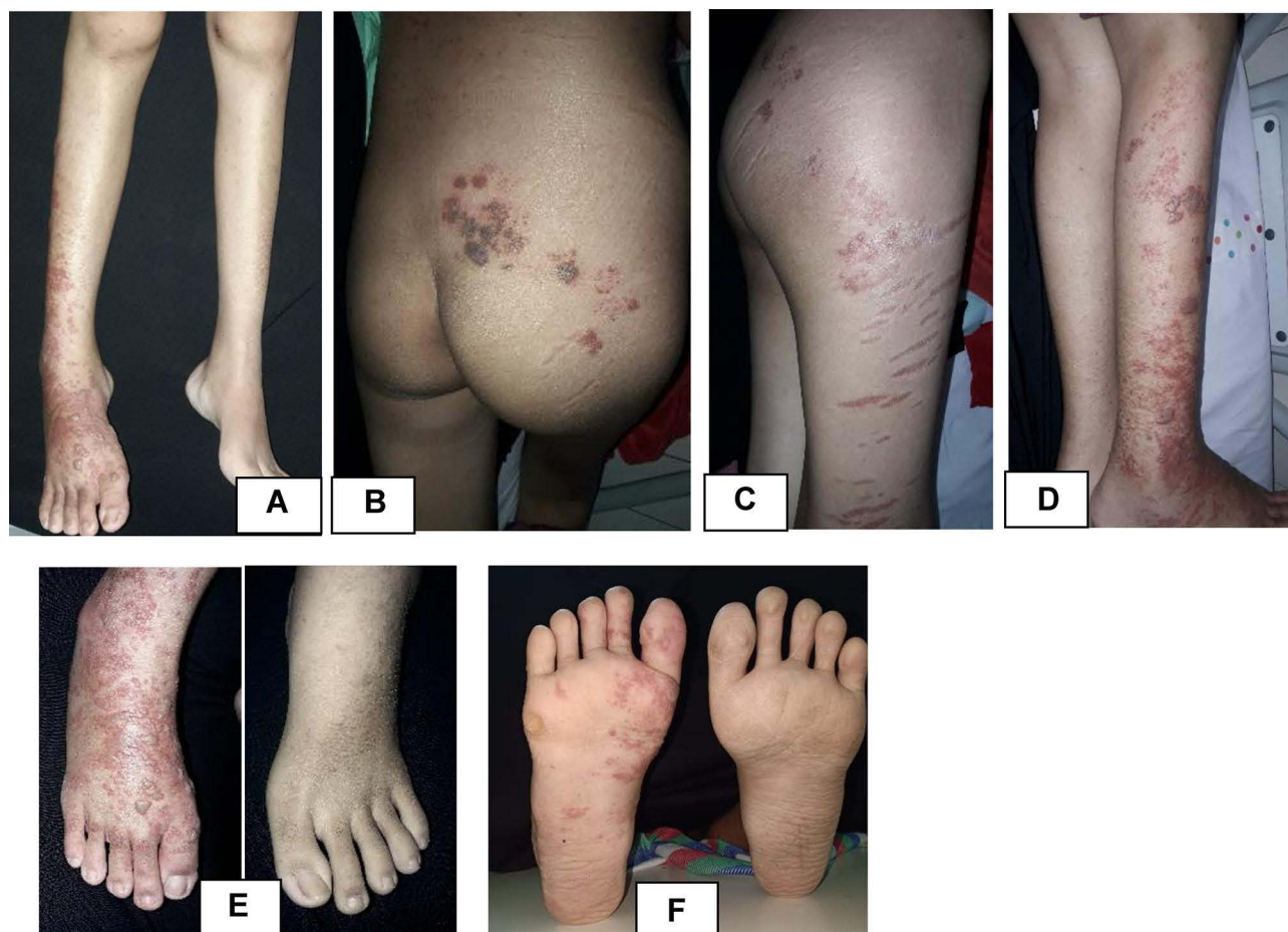
Figure 2 Dermatologic examination. Appearance of vesicles and some were confluent into bullae with erythematous base scattered on cruris dextra (A and D), lateral side of femur dextra (C), gluteus (B), and dorsum and plantar pedis dextra (E and F). Appeared striae on lateral side of right femur (C).