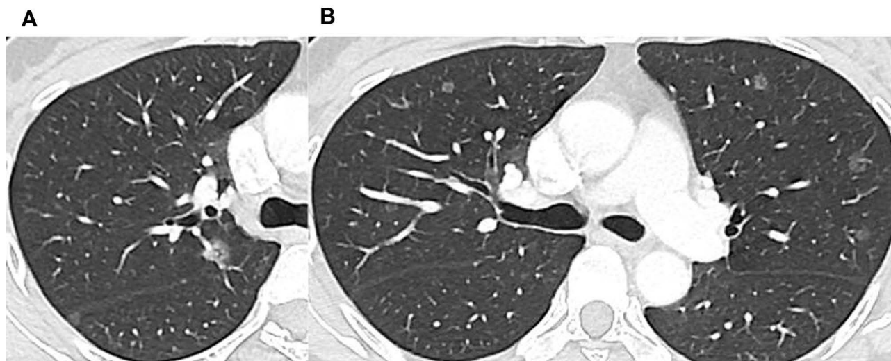
Figure 1 Images of a 48-year-old female tyrosine kinase inhibitor (TKI)-naive patient with T790M mutation-positive non-small-cell lung cancer (NSCLC). (A) Computed tomography (CT) image in the axial lung window setting showing a 1.2-cm lung nodule in the right upper lobe under the horizontal fissure, with an internal air bronchogram. (B) Axial CT image showing multiple ground-glass nodules in the bilateral lungs.

detection rates increase with higher sensitivity methods, 33,34 false-positive rates should be considered in clinical molecular testing, especially for samples with low DNA quality and quantity and/or formalin-fixed and paraffin-embedded-derived artifacts. 35,36 Here, we used two routine detection methods, ARMS and NGS, to accurately diagnose primary T790M mutation, in line with the current clinical reality. Moreover, primary and acquired T790M mutations coexisted with 21L858R and 19del , respectively, while rare mutations were relatively common in primary, rather than in acquired, T790M mutations, which was consistent with the results of a previous study. 17