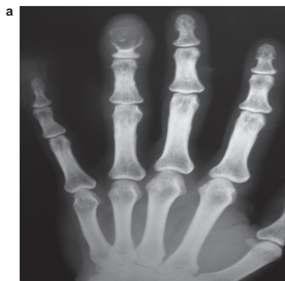
Figure 2a X-ray (AP view) showing intraosseous epidermoid cyst of distal phalanx of right ring finger.

Epidermoid bone cysts are rare and usually involve the skull and the phalanges. Harris initially documented intraosseous epidermoid cysts of the digits in 1930. 9 The lesion is most common in adults, especially manual workers; males are more frequently affected than females. Patients are most often in their fourth or fifth decade of life (range 8 to 83 years). The most common site for phalangeal involvement is the distal phalanx of the fingers. 2,3 They are regarded as congenital, traumatic, or iatrogenic in origin. 1 The time from implantation to presentation of the cyst is not known as the