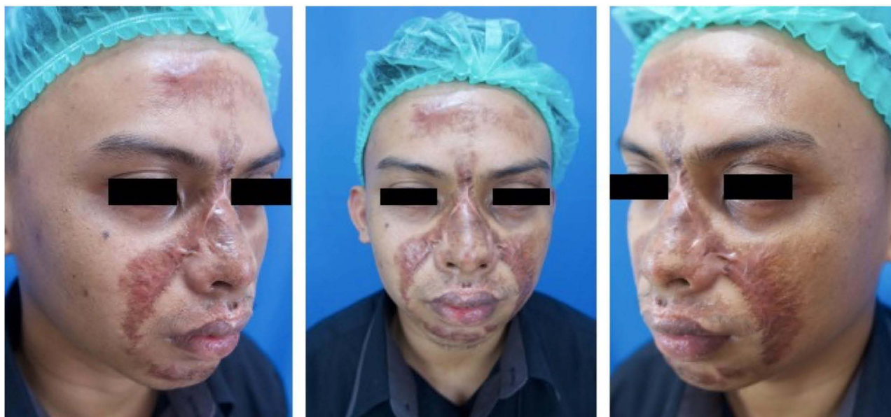
Figure 1 The patient's clinical photograph at the first visit.

Burn injury is a significant cause of morbidity and mortality worldwide which also affects the patients' mental health and quality of life. 3 Trauma caused by burn injury can develop into scar. 11 The prevalence of post-burn hypertrophic scars varies from 32% to 72%. 2 Hypertrophic scar is a common pathologic scar that develops after burn trauma 1 and becomes the main complication of burn. Risk factors that contribute to the development of hypertrophic scar are the wound's depth, skin color, and wound healing time. 2 Wound healing consists of four phases, namely coagulation, inflammation, proliferation, and remodeling. 12 Recent research suggested that lasers can be an option over surgery in minimizing the appearance of scars. 13 Hypertrophic scar responded well to laser therapy. 6