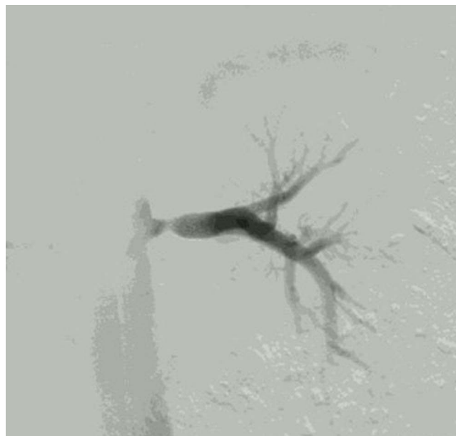
Figure 3 Conventional angiography image of the left renal artery after balloon dilation was performed.

Two years after the discharge, patient is normotensive on carvedilol, amlodipine and low dose doxazosin. Her blood count, CRP, creatinine and LDH levels are normal. She continues to receive tocilizumab (which was converted to subcutaneous form after the COVID-19 pandemic), 4 mg/day methylprednisolone and acetylsalicylic acid.