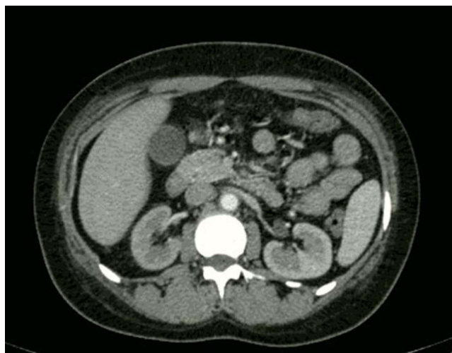
Figure 2 Almost total occlusion of the lumen of proximal 3 cm segment of right renal artery, starting from the level of ostium.