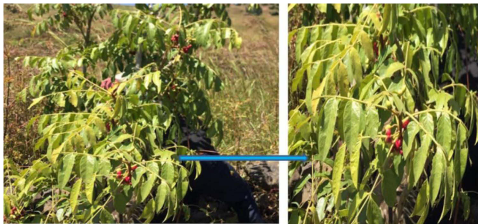
Figure 1 Picture of Brucea antidysenterica.

The powdered leaf was extracted using cold maceration. Methanol (80% (V/V)) was chosen as a solvent for its better yield, obtained in previous studies on this plant. 19,20 Erlenmeyer conical flasks, containing the extraction mixture, were fixed on mini orbital shakers adjusted at 145 revolutions per minute (rpm) with periodic agitation for three days. Then, the mixture was filtered with Whatman's filter No.-1 paper, and the mark was re-macerated to have additional yield. The