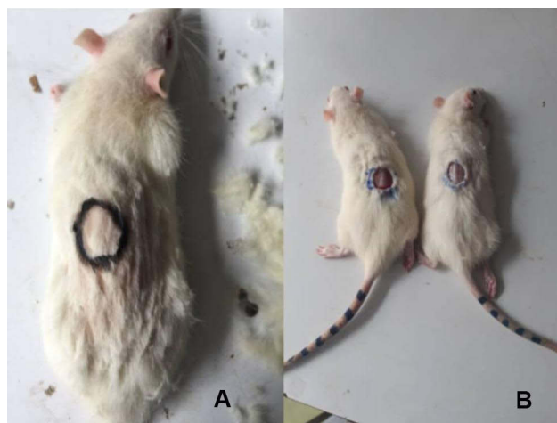
Figure 2 Excision wounding of animals. 3A - circularly marked area to be excised, 3B - excised wound area.

On wounding day, animals were anesthetized using the same technique described for the excision model. Then, the dorsal fur was shaved and a three-cm long longitudinal paravertebral incision was made through the skin and subcutaneous