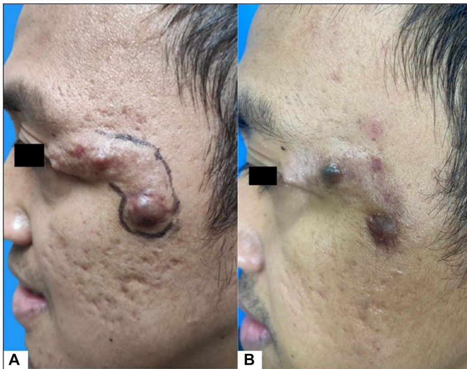
Figure 1 (A) Clinical manifestations of spiradenoma in the form of skin-colored and erythematous nodules on the left eyelid and left temple before triamcinolone acetonide injection. (B) Spiradenoma lesions after triamcinolone acetonide injection.