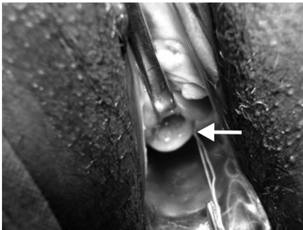
Figure 1 Arrow showing intrauterine contraceptive device thread coming through posterior fornix.

motion tenderness, nodularity, and tenderness in the pouch of Douglas. Her abdominal radiograph revealed an IUCD misplaced in the pelvis (inset, Figure 2), and transvaginal ultrasonography revealed the IUCD in the pouch of Douglas. The patient was planned for laparoscopic removal of IUCD but due to dense adhesions between the posterior surface of the uterus and rectosigmoid junction, the procedure was converted to a laparotomy (Figure 2). After careful dissection, the vertical limb of the IUCD was visualized under the serosa of the rectum. The IUCD was removed and the serosal tear at the rectosigmoid junction repaired. Postoperative recovery was uneventful.