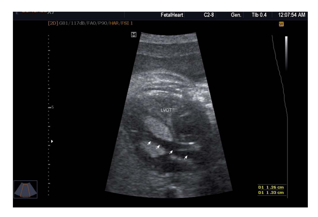
Figure 2 Normal Left ventricular outflow tract at 34 weeks of gestation (The arrow (†) indicates Left Ventricular Out flow Tract (LVOT)).

for her age. An echocardiography study by a pediatric cardiologist revealed well-circumscribed hyperechoic masses on both left ventricular papillary muscles, each measuring 21.8 mm by 9.2 mm and 14.7 mm by 8.5 mm (Figure 3) and creating no left ventricular inflow obstruction (Supplementary Video 1).