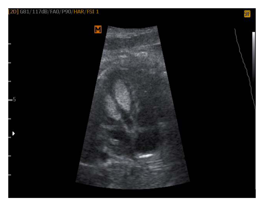
Figure I Two fetal left ventricular papillary muscle echogenic mass (rhabdomyoma) at 34 weeks.

At her 7th month, the child was evaluated again, and upon history inquiries, the infant was doing great developmentally for her age group. The infant was examined for neurodevelopmental delay, and the child was growing appropriately