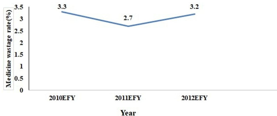
Figure 1 Trend of the medicine wastage rate of Dire-Dawa administration public health facilities, Ethiopia (EFY2010-2012), June 2021.