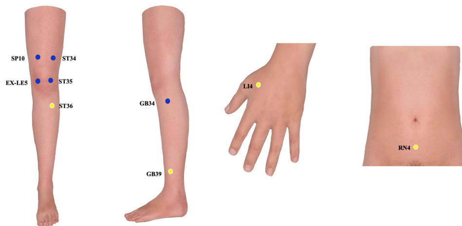
Figure 3 Locations of acupuncture points used in group H and group L. Blue circles: Obligatory acupuncture points. Yellow circles: Customized acupuncture points.

1200mg per day. The dose and timing of usage will be documented in a case report form (CRF). Assessor will not evaluate outcomes for participants who take rescue medication within 48h before the baseline and outcome measurements, the outcome measurement visit will be postponed.