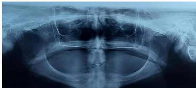
Figure 5 Panoramic Radiography confirming complete anodontia.