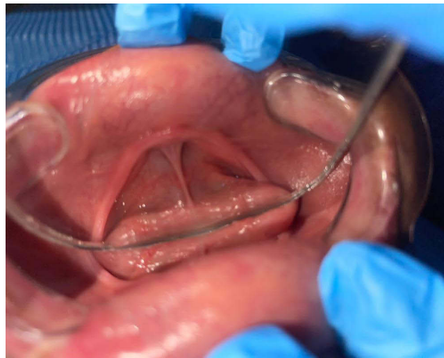
Figure 4 Vertical reduction of lower ridge with very adherent frenulum.