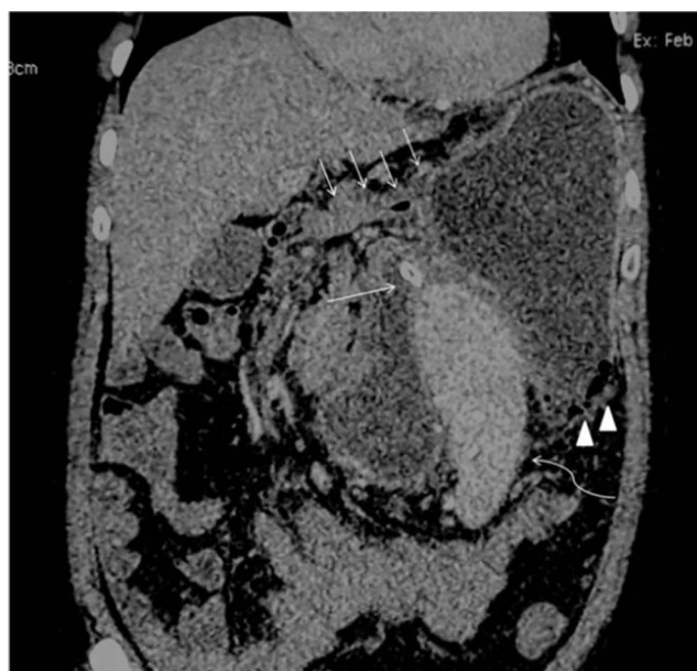
Figure 1 CECT scan showing gastric volvulus multiple intramural air foci are also confirmed (arrowheads). The cross-section of the nasogastric tube is seen (single thin arrow). The antro-pyloric canal is seen close to the fundus and below the liver (multiple thin arrows). The spleen is seen in an abnormal location anterior to the stomach (curved thin arrow).

Within six hours of admission, despite adequate resuscitative measures, her condition further deteriorated, and a contrast-enhanced CT (CECT) scan showed a twist in the stomach on its mesenteric axis. A wandering spleen was found to adhere to the anterior gastric wall (Figure 1). It did not show any vascular compromise. Multiple gas foci in the stomach wall, suggestive of gangrenous changes, were also observed. Emergency laparotomy revealed a distended stomach with mesenteric-axial torsion of approximately 180°. After detorsion and decompression of the stomach, multiple gangrenous patches were observed only in the body, whereas the fundus and antrum appeared healthy. The spleen was congested, enlarged, and had a long pedicle, without a twist. Moderate hemorrhagic ascites was present, and the rest of the viscera was unremarkable. Segmental resection of the gangrenous gastric body was performed, followed by complete mobilization of the duodenum and end-to-end tension-free anastomosis between the fundus and antrum. Pyloroplasty was performed as the drainage procedure. A splenectomy had to be performed due to its intimate relation to the anterior wall of the stomach, and also from the concern that retaining the spleen may lead to recurrence of volvulus. The patient's postoperative course was uneventful, except for superficial abdominal wound dehiscence. The nasogastric tube was removed on the second postoperative day, and the patient