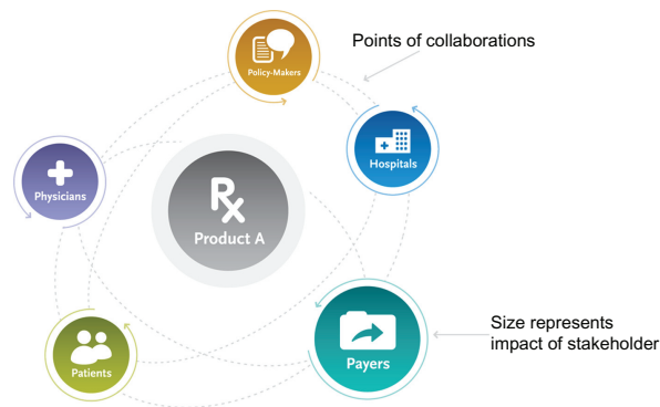
Figure 1 360° view of products by multiple market stakeholders.

intended to study treatments under ‘real world’ conditions of use. 11 The study design can be viewed as a hybrid between a randomized clinical trial (RCT) and an observational cohort study, with randomization to avoid confounding, and end-points evaluated mainly through observational follow-up. An example is the VOLUME Trial to evaluate the long-term pulmonary and cardiovascular safety of an inhaled insulin powder. 12