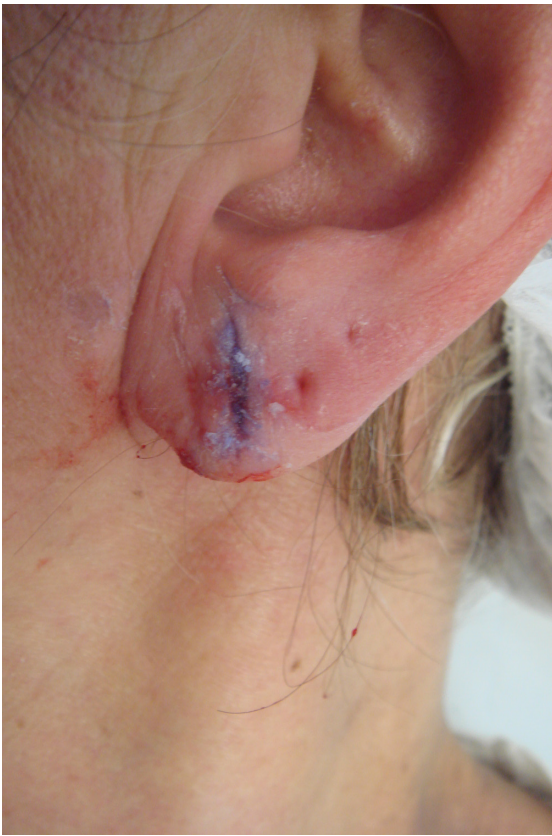
Figure 7 Reconstruction of an earlobe defect by removal of the epithelium by radiosurgery and application of acrylic tissue glue.

of the patients were satisfied with the aesthetic results. The procedure resulted in good functional and cosmetic results, with low costs, minimum risks, and was easy to apply. 37