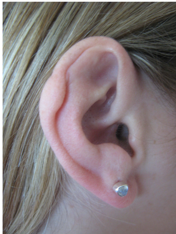
Figure 6B Seven years later with destruction of helical cartilage.

surgical and nonsurgical procedures available to deal with this problem. Brazilian authors presented a nonsurgical procedure for incomplete earlobe cleft repair using trichloroacetic acid 90%. They assessed 32 patients with a total of 53 earlobes to be noninvasively repaired. The complete treatment varied from 2 to 50 days with repeated application of trichloroacetic acid 90%. No recurrences were observed during one year of follow-up. All of the clefts were totally repaired, and all