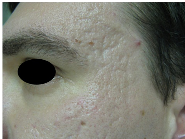
Figure 2A Fractional CO 2 laser for acne scars before treatment.

Fractional CO 2 laser with a laser fluence from 2.07–4.15 J/cm 2 has been shown to increase tissue repair both clinically and on cytokine levels. 11 Efficacy and safety of