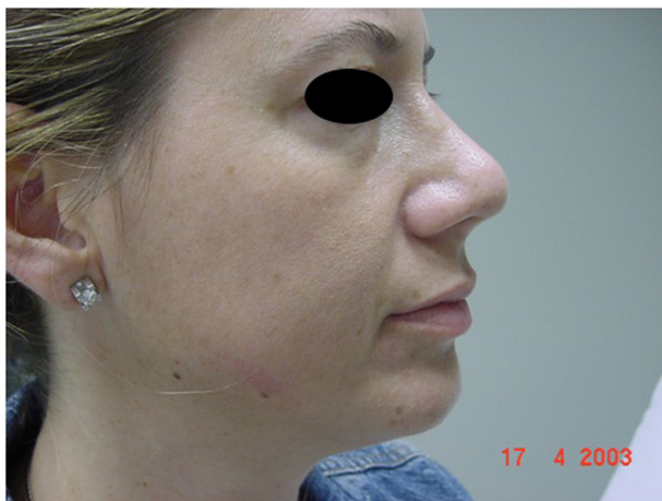
Figure 4A Hyaluronic acid filler for facial sculpturing (midface) before injection.

Liquid lift of the middle and lower face is realized by deep, periosteal placement of higher crosslinked monophasic HA fillers in the cheekbone area. By this placement, the filler depot has a longer durability compared to nasolabial folds or cheeks because of the limited movements in this region. There is also a mild effect on upper lip position. 28 In nasolabial fold treatment, biodegradable microparticle injectables, including Radiance (BioForm, San Mateo, CA) or Radiesse (Merz) provide longer lasting results. Microscopically new collagen