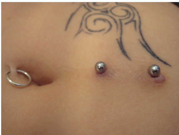
Figure 5 Piercing, tunnelling and tattoo in a 24-year-old female. Skin inflammation at the tunnelling site.

Incomplete earlobe clefts are another possible complication of piercing and the wearing of jewellery in this area. There are