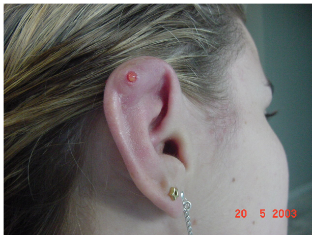
Figure 6A Cartilage destruction after piercing due to an inflammatory reaction.

surgical and nonsurgical procedures available to deal with this problem. Brazilian authors presented a nonsurgical procedure for incomplete earlobe cleft repair using trichloroacetic acid 90%. They assessed 32 patients with a total of 53 earlobes to be noninvasively repaired. The complete treatment varied from 2 to 50 days with repeated application of trichloroacetic acid 90%. No recurrences were observed during one year of follow-up. All of the clefts were totally repaired, and all