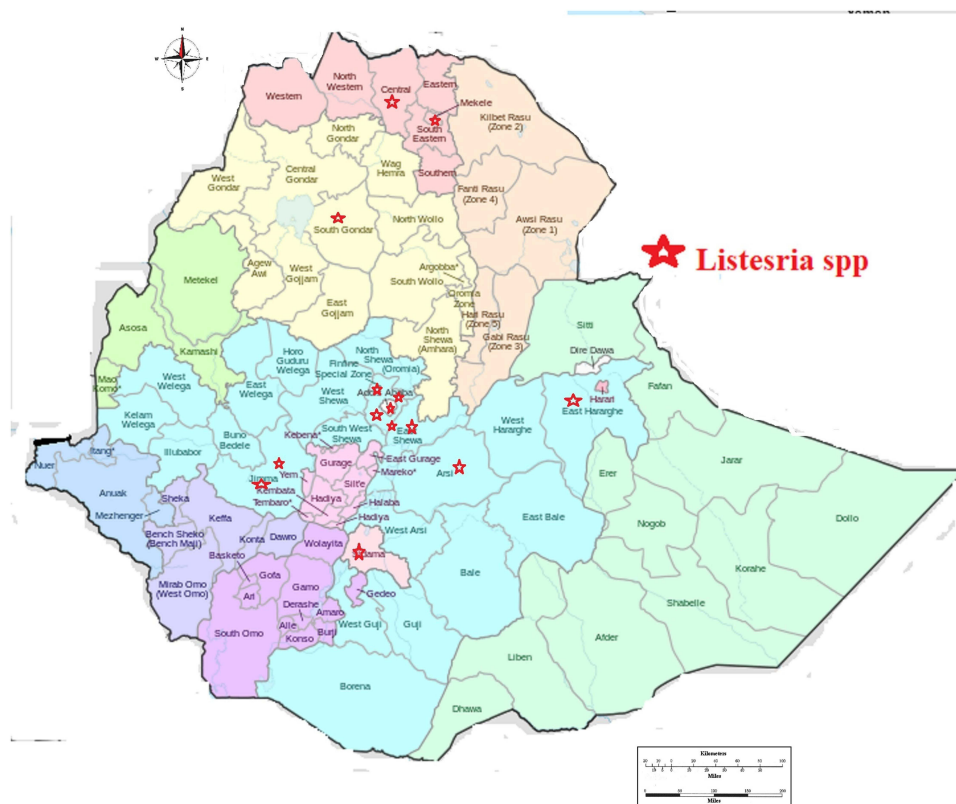
Figure 1 Map of Listeria spp reported area.