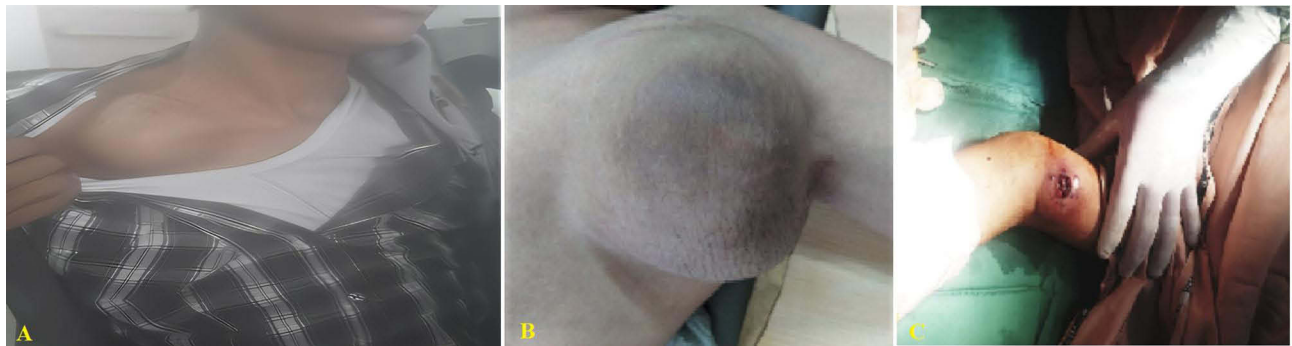
Figure 1 Arterial aneurysms caused by repeated central line access (A) Right subclavian artery aneurysm. (B) left subclavian to axillary artery aneurysm. (C) left brachial artery pseudoaneurysm).

statistically significant. Statistical analyses in this study were conducted using IBM SPSS version 22 software (IBM Corp., Armonk, New York).