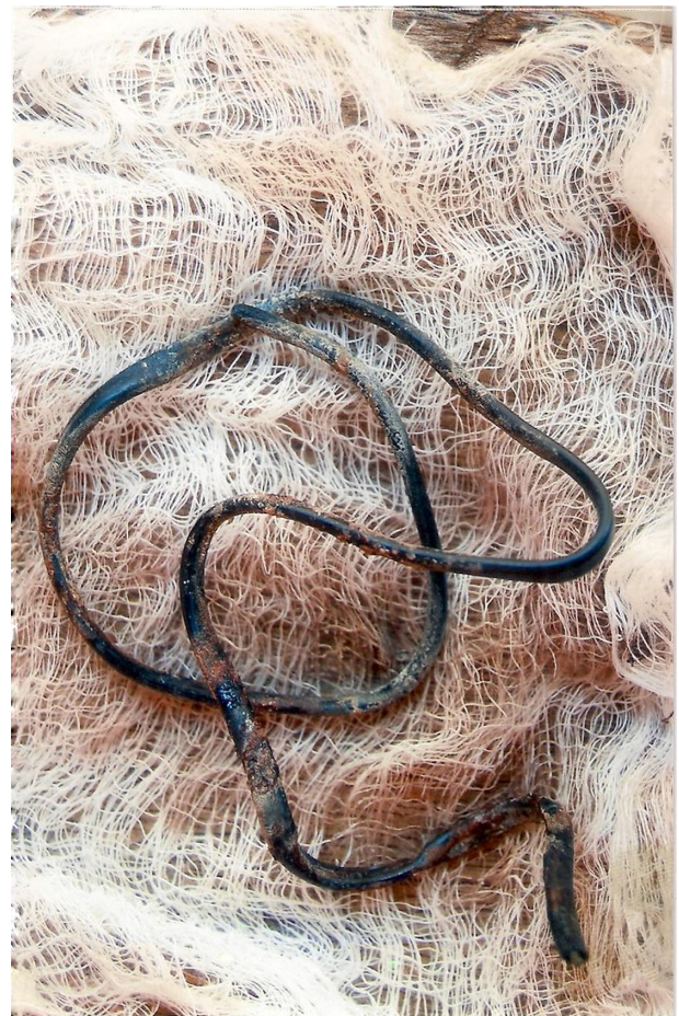
Figure 2 Intravesical foreign body.

Foreign bodies in the urinary bladder represent a urologic challenge that requires prompt management 7 and should be treated as emergencies. The wide variety of techniques for