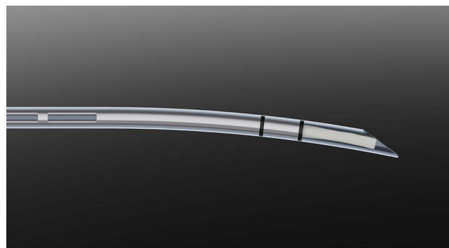
Figure 2 The scleral allograft microtrephined into a minimally-modified, bio-scaffolding implant.

Using scleral allograft to enhance uveo-scleral outflow is another promising clinical application of ab-interno scleral tissue reinforcement (Figure 2). Homologous conforming bio-tissue has potential advantages over rigid implantable hardware devices because of its porosity, hydrophilic aqueous permeability and structural stability without the fibrosis-inducing bio-mechanical mismatch to the surrounding native tissues. Intraocular implantation of a scleral allograft in the supraciliary space has been shown to structurally enhance and maintain the suprachoroidal outflow because of the conductive and reinforcing properties of the allograft acellular matrix (Figure 3). 53 Early results are encouraging in that respect - in a study with 12 months of follow-up, flexible conforming bio-tissue was well tolerated without anterior