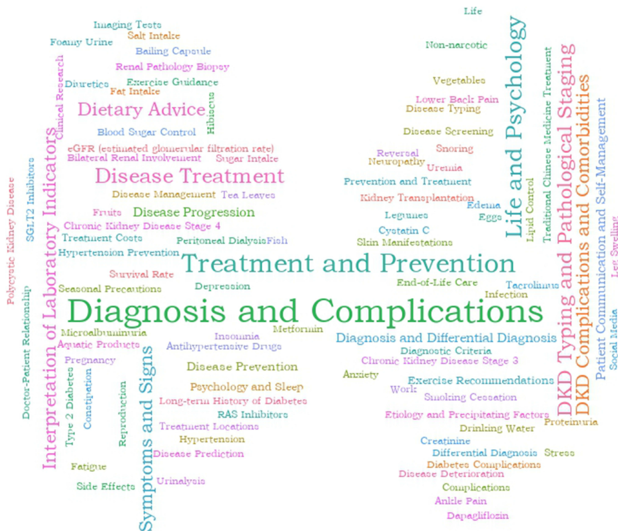
Figure 2 Word Cloud of Qualitative Analysis on Common Needs Among DKD Patients.

Notes: *To further illustrate the demands of DKD patients, we generated a word cloud resembling the contour of a kidney. The size of words in the cloud represented their frequency in the dataset, with larger font sizes indicating higher frequency and smaller font sizes indicating lower frequency. This visual representation allowed a visual portrayal of the key concerns of DKD patients, offering a vivid and valuable insight into their needs for further comprehension.