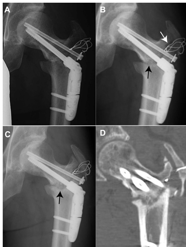
Figure 2 (A) A radiograph obtained 2 months after osteotomy had not yet indicated bone union at the site of osteotomy. (B) A radiograph obtained 4 months after osteotomy showed the presence of osteolytic lesions around the trochanteric wire (white arrow), and the osteotomy site near the lesser trochanter appeared to be fuzzy (black arrow). (C) A radiograph obtained 9 months after osteotomy revealed the progression of osteolytic changes at the site of transtrochanteric osteotomy (black arrow), associated with varus deformity with the neck-shaft angle. (D) A computed tomography scan obtained 11 months after osteotomy demonstrated nonunion at the site of osteotomy.

Nine months after surgery, a radiograph revealed the progression of osteolytic changes at the site of the transtrochanteric osteotomy, associated with varus deformity with the neck-shaft angle (Figure 2C). A computed tomography scan obtained 11 months after surgery demonstrated nonunion at the site of transtrochanteric osteotomy (Figure 2D). The level of C-reactive protein obtained 9 months, and 1 year after surgery had been 0.37 and 0.10 mg/dL, respectively (Figure 1). The erythrocyte sedimentation rate was 10 mm 1 year after surgery.