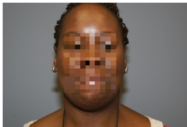
Figure 2 Patient 6 weeks postoperatively after left superficial parotidectomy. A similar result can be seen as compared to the right side. Facial contour and symmetry has been restored with excellent cosmetic outcome.

The initial studies regarding BLEC and surgery were performed in the early 1990s. Shaha et al undertook a retrospective review of 35 parotidectomies (20 superficial parotidectomies, 15 removal of the parotid tail for isolated cysts) for BLEC with up to six years of follow-up. 15 A complete response was seen in all 35 patients, although cysts did develop on the contralateral side in several patients. A study by Ferraro et al looked at surgical enucleation of 10 patients with bilateral BLEC (20