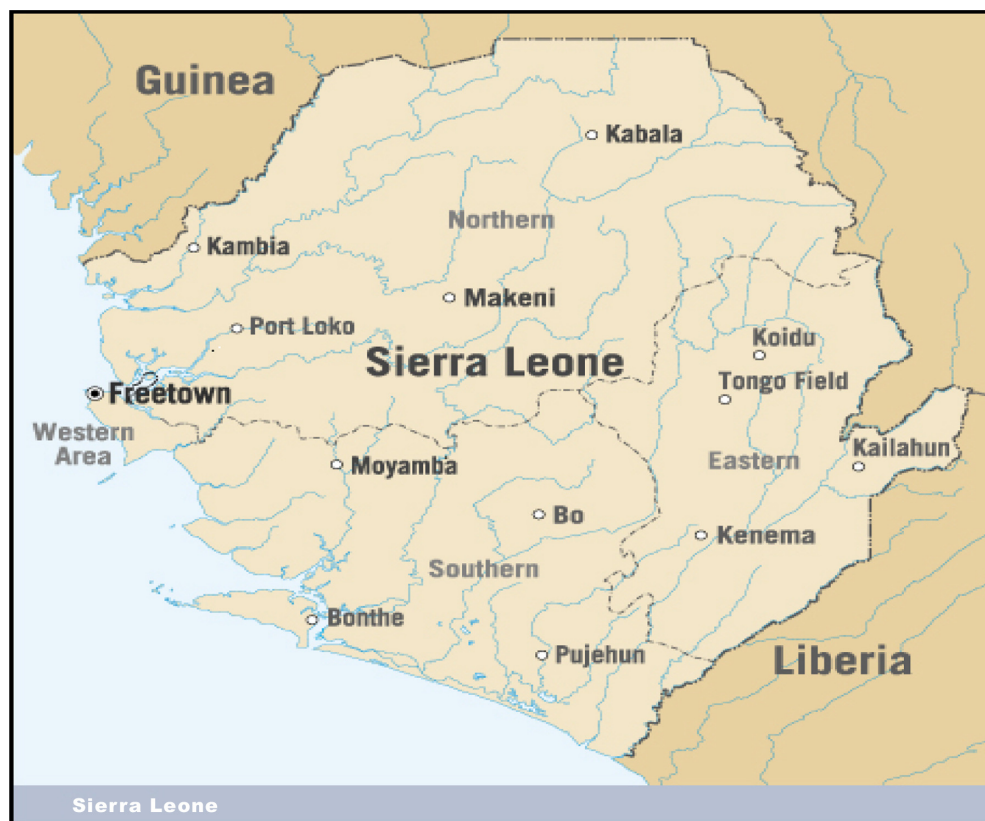
Figure 1 Sierra Leone with its main districts, cities, and neighboring countries.

Sierra Leone is on the west coast of Africa, surrounded by Guinea and Liberia and bordered by the Atlantic Ocean (Figure 1). The area of Sierra Leone was once a colony and protectorate governed by the British Empire from the 1780s. Sierra Leone gained independence from the UK in 1961. The country has twelve districts plus the Western Area, which includes Freetown, the capital, and the villages on the Peninsula.