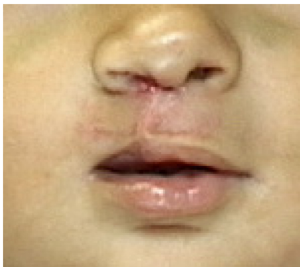
Figure 1 Right unilateral cleft lip hypertrophic scar.

Data were analyzed using the software JMP (v 9; SAS Institute Inc, Cary, NC). Bivariate statistics (Fisher's exact tests) were used to analyze HTS rates in patients stratified by risk factors including ethnicity, cleft laterality (unilateral or bilateral), gender, and cleft type (incomplete or complete). To identify independent predictors of HTS formation, multivariable logistic regression was performed using the same risk factors from the stratified analysis as independent variables. HTS was used as the dependent variable for the regression model. A value of P < 0.05 was considered statistically significant.