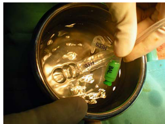
Figure 3 Water bubble is seen as air passes through gastrostomy tube following distension of stomach with 50 cc of air through the nasogastric tube.

Finally, the external retention ring of the gastrostomy tube was securely placed on the skin overlying the wound (Figure 6).