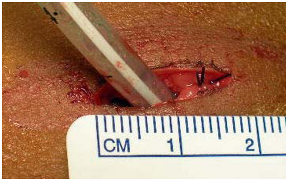
Figure 4 Gastrostomy tube anchored to anterior abdominal wall, note size of wound is less than 2 cm.